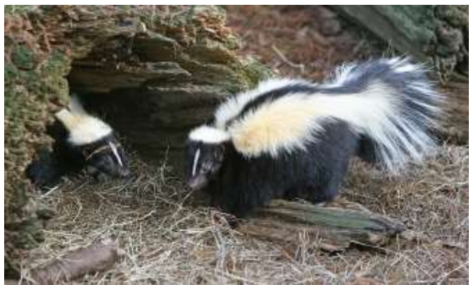
Striped Skunk, Mephitis mephitis