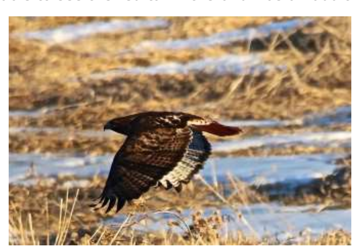
(3) Red-tailed Hawk , <u>Buteo jamaicensis</u>, © Dick Harlow

The back is always going to be dark brown, and its head a slightly lighter brown with a touch of rust or reddish brown and would appear dark from a distance. Therefore, looking at this hawk with its back to you would not give you the satisfaction of knowing exactly who it might be since there are other raptors that are dark on the back and head. However, if you have good binoculars you would be able to see the red tail if the bird was an adult.