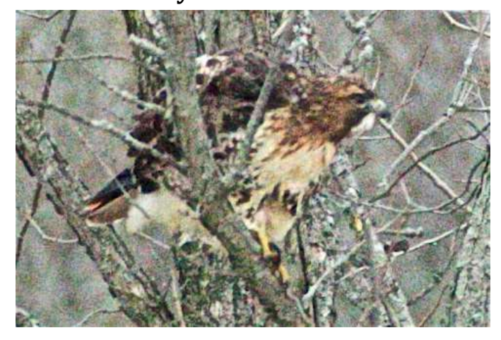
(2) Red-tailed Hawk , <u>Buteo jamaicensis</u>, © Dick Harlow

You can see the bellyband in picture 1 and evidence of a band in picture 2 and the red tail in picture 3. Notice that the chest and belly of the hawk around the bellyband of brown feathers is flanked white above and below the band. This band can be made of heavy brown feathers or be light brown feathers and fewer in number, but all red-tails here in the east have a bellyband whether you are looking at them sitting on a branch or flying overhead. The red tail depends on whether you are looking at an adult or an immature and whether you are looking at the dorsal side of the bird. And, dependent on the light the tail can appear dark rusty red.