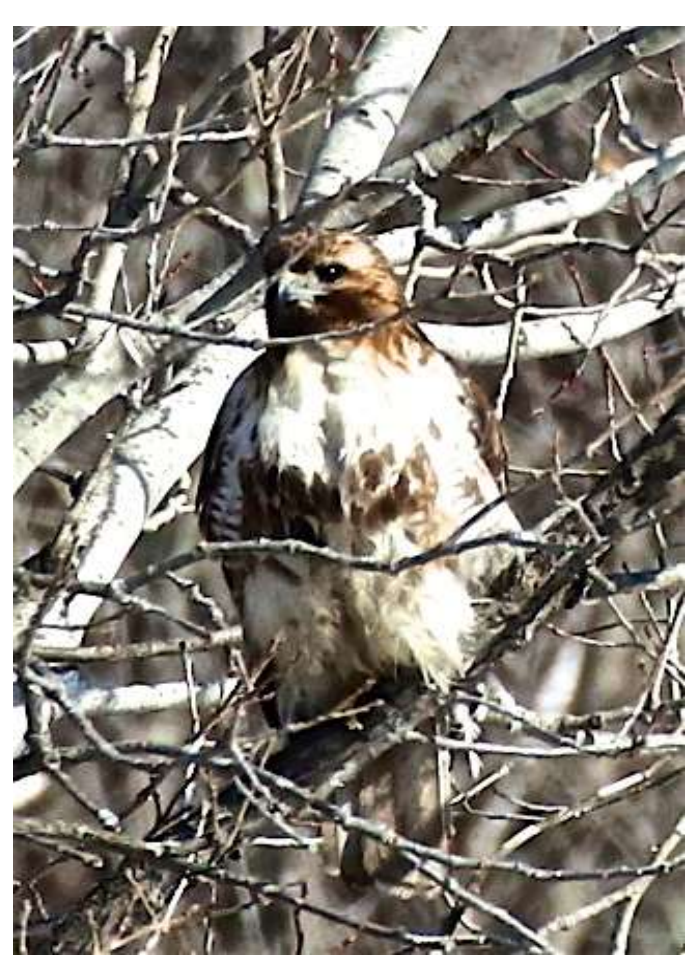
(1) Red-tailed Hawk, <u>Buteo jamaicensis</u>,